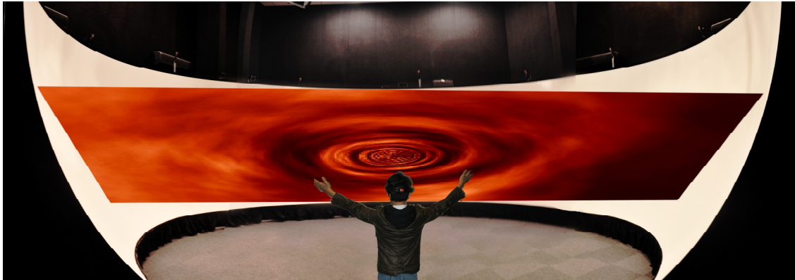
Figure 1: A performer tries to control the sounds and the tunnel properties (i.e. colour and speed) generated from his EEG, by adjusting the mental states associated with the heard sound and shown graphics.

The immersive room offers a unique and powerful platform to represent brain waves in a tangible fashion. Although neural feedback has been investigated for quite some time now, it has never been implemented in an interactive and immersive room. Such novel representation of brain signals can be valuable for therapy, diagnosis, entertainment, and arts. Indeed, several psychological and medical studies have confirmed that virtual immersive activity is enjoyable, stimulating, and can have a healing effect. These studies have also shown that the effect is stronger with virtual reality (VR) feedback than with simple 2D feedback [37-40].