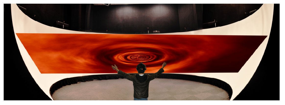
Figure 1: A performer tries to control the sounds and the tunnel properties (i.e. colour and speed) generated from his EEG, by adjusting the mental states associated with the heard sound and shown graphics.

The immersive room offers a unique and powerful platform to represent brain waves in a tangible fashion. Although neural feedback has been investigated for quite some time now, it has never been implemented in an interactive and immersive room. Such novel representation of brain signals can be valuable for therapy, diagnosis, entertainment, and arts. Indeed, several psychological and medical studies have confirmed that virtual immersive activity is enjoyable, stimulating, and can have a healing effect. These studies have also shown that the effect is stronger with virtual reality (VR) feedback than with simple 2D feedback [37-40].